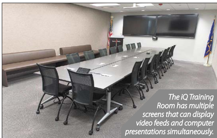
The iQ Training Room has multiple screens that can display video feeds and computer presentations simultaneously.