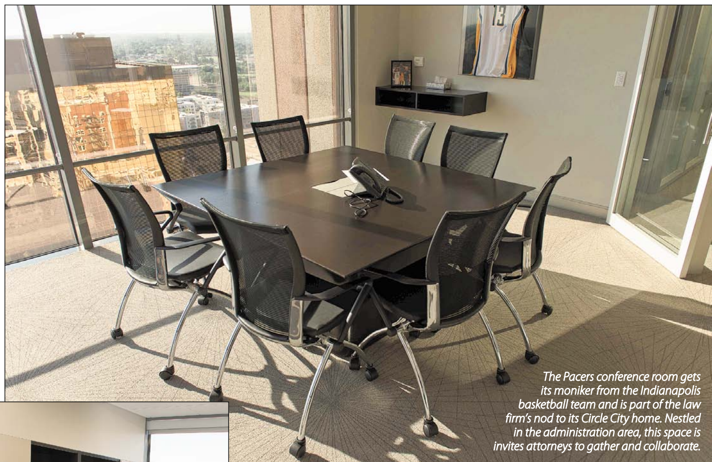
The Pacers conference room gets its moniker from the Indianapolis basketball team and is part of the law firm's nod to its Circle City home. Nestled in the administration area, this space is invites attorneys to gather and collaborate.

A touch of whimsy is added by the firm's embrace of Indianapolis. Formal conference rooms are named after the city's landmarks, and the smaller meeting rooms